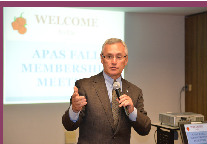
YSU President James Tressel addressed APAS members at our fall membership meeting.